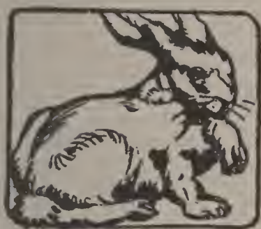
Br'er Rabbit Was a Very Little Rabbit.

“I MUST tell you,” began daddy, “about the way old Br'er Rabbit tricked old Br'er Fox.